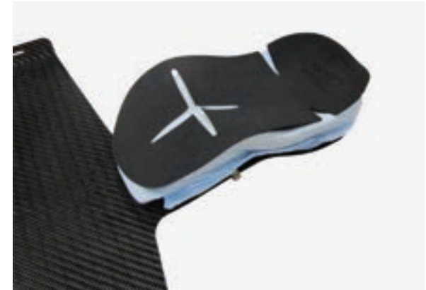
Art. N° 25070/10 Flexible shim - 1 mm (Package of 10 pieces)