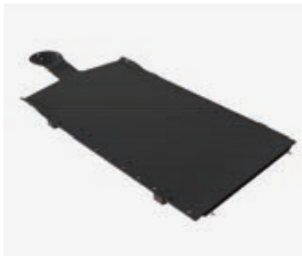
Art. N° 25000/22 Extension base plate and overlay Pin interface - for Mevion