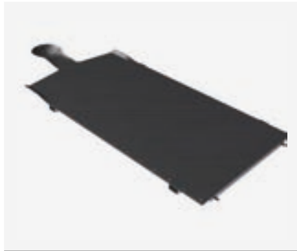
Art. N° 25000/1 Extension and overlay Pin interface