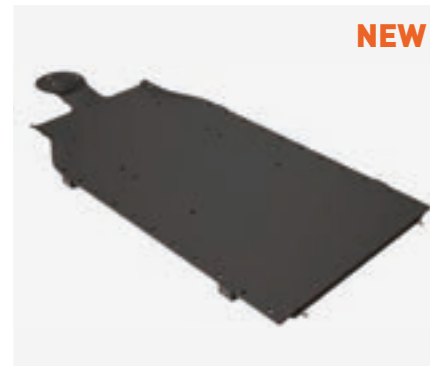
Art. N° 25000/16 Extension Pin interface Paediatric 8-16 years old