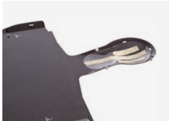
Art. N° 25000/7/20 Head rest indexing plate (Package of 20 pieces)