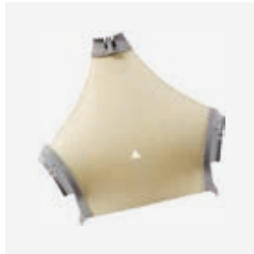
Art. N° 25100/16MI+N 3-points head mask Nanor 1.6 mm micro+ with nose hole