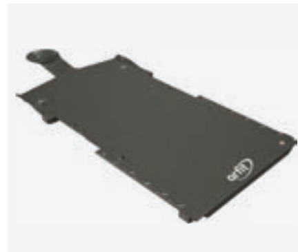
Art. N° 25000/26 Overlay Compatible with Elekta HexaPOD™ evo RT System (Art. N° 25000/26/HX)