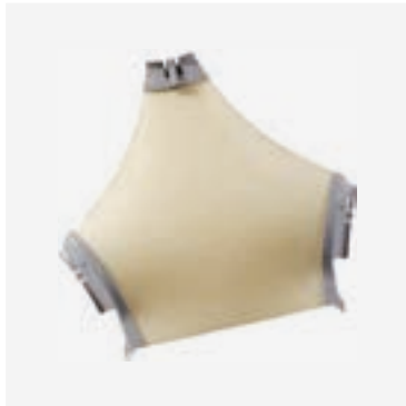
Art. N° 25100/16MI+N/NH 3-points head mask Nanor 1.6 mm micro+