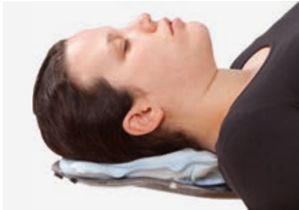
Art. N° 18090 Moldcare cushion 150 x 200 mm