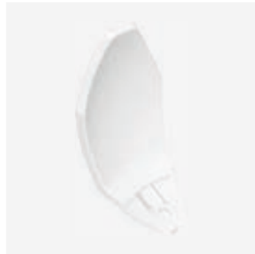
Art. N° 25000/6 Cranial back-stop

To ensure that the head of the patient is correctly positioned, and prior to the moulding of the mask, a cranial back-stop is attached to the cup-like head rest part of the base plate.