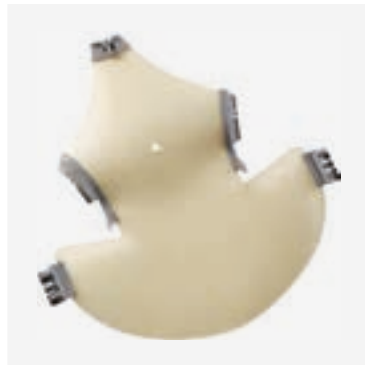
Art. N° 25105/2MI+N 5-points head, neck and shoulders mask Nanor 2 mm micro+ with nose hole