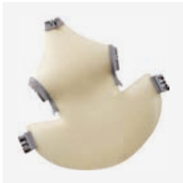
Art. N° 25105/2MI+N/NH 5-points head, neck and shoulders mask Nanor 2 mm micro+