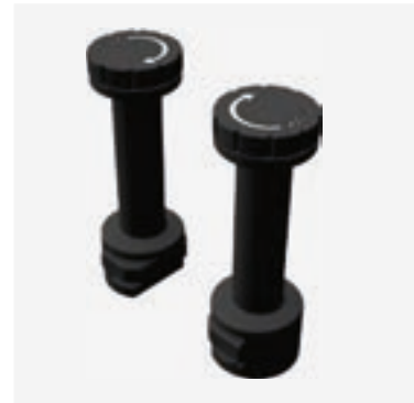
Art. N° 25000/17/A Art. N° 25000/17/B Hand holds

A set of hand holds are available to comfortably position the hands, arms and shoulders of the patient.