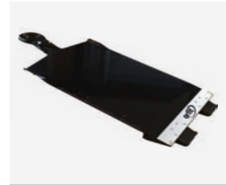
Art. N° 25000/20 Extension Clamp interface